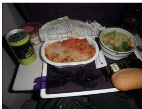
In flight meal on Virgin Atlantic