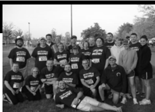
Chase Corporate Challenge