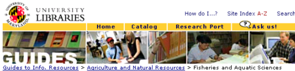
Figure 2. Research guides that use standard language across their guides, based on templates.