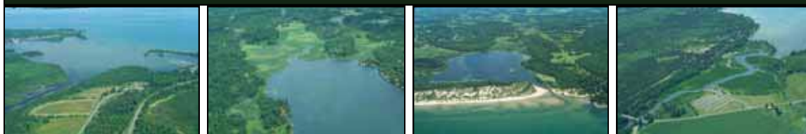
Braddock Bay Open Embayment