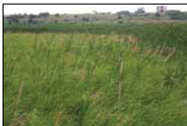
Cattail invading meadow marsh

The results suggest that canopy-dominating, moisture-requiring cattails were able to invade meadow marsh at higher elevations because sustained higher lake levels allowed them to survive and outcompete sedges and grasses that can tolerate periods of drier soil conditions.