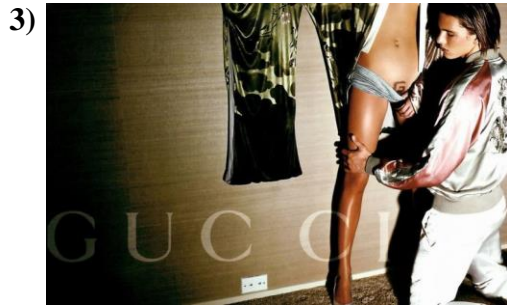
Figure 3: Gucci. "Fashion Ego," by Fiona, 2016 ( contemplatingcatastrophes.org/fashion-ego/ ). In the public domain.