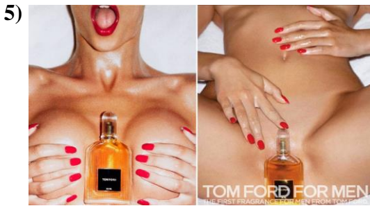
Figure 5: Tom Ford. "Controversial Campaigns: 9 Banned NSFW Fashion Ads You Probably Shouldn't See," by M. Stempien, 2015 ( www.justluxe.com/fine-living/chatter/feature-1960587.php ). In the public domain.