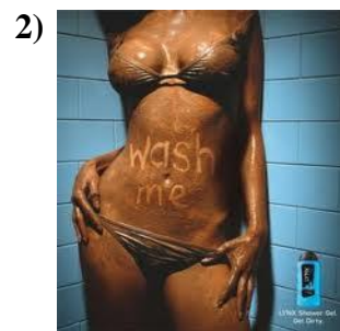
Figure 2: Axe. "Rage against the media, not against ourselves," by V. Rodriguez, 2014 ( womenandmediafa2014.blogspot.com/2014/10/rage-against-media-not-against-ourselves.html ). In the public domain.