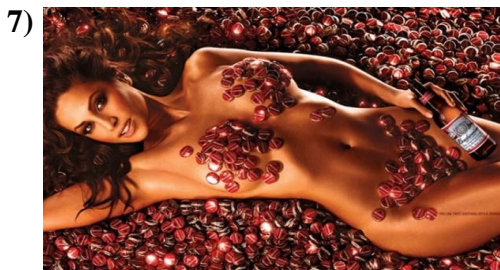
Figure 7: Budweiser. "Objectifying Women in Beer Advertisements," by Timali & Haya, 2013 ( https://sheisnotathing.wordpress.com/2013/11/01/objectifying-women-in-beer-advertisements/ ). In the public domain.