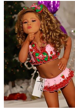
Figure 12: Toddler’s & Tiaras . "TLC's Toddler's and Tiaras: Way Too Much or Just Enough?," by C. Parish, 2014 ( tvcriticism2014.blogspot.com/2014/05/tlcs-toddlers-and-tiaras-way-too-much.html ). In the public domain.

pageants and the “glitz” of them (Tamer, 2011). The little girls catch the “male gaze” because they wear sexualized outfits that are age inappropriate (See Figure 12). In the reality television show Toddler’s & Tiaras , the girls themselves believe that when they have their physical appearances altered or changed, they become more “beautiful” and valuable to the audience (Palmer, 2013). This importantly points out that young girls and women are always competing to grab attention, particularly men’s. Why does it matter so much as to what men think? The “male gaze” is largely rooted in pageantry because women are to be looked at by men. The “male gaze” supports patriarchal capitalism because society profits off of young girls’ and women’s interests in wanting to look “beautiful” or acceptable in the audience and judge’s eyes.