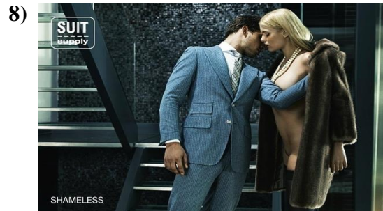
Figure 8: Suit Supply. "Whatever Wednesday: Tiiu Kuik for FLARE, Project Runway Winner, Shameless Suit Ads and more," by Beautifully Invisible, 2010 ( www.beautifully-invisible.com/2010/11/whatever-wednesday-tiiu-kuik-for-flare-project-runway-winner-shameless-suit-ads-and-more.html ). In the public domain.