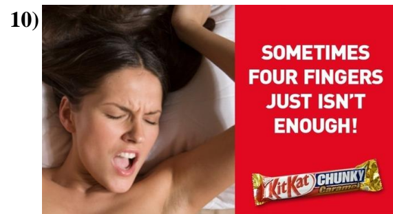
Figure 10: Kit Kat. "I don't believe this is an official Kit Kat ad (nsfw-ish)," by M. Copyranter, 2012 ( copyranter.blogspot.com/2012/03/i-dont-believe-this-is-official-kit-kat.html ). In the public domain.

The second study I conducted comprised of two interviews with undergraduate students, Isabella and Bethany 3 , 18-29 years of age, who were participants in pageants and/or dance competitions. My focus for these two interviews was to gain insight into the participants' personal experiences with performing onstage. I wanted to know if as females, they felt objectified or judged upon their physicality. I was also interested in how the participants perceive the production of beauty to tie into the violence, sexualization, and objectification of the female body within pornography. Both participants provided experiential knowledge, as they have experienced onstage performance firsthand. The purpose of this part of my project was to discover what parallels might be present in both the pageant and porn industries by looking at the overarching theme of the patriarchal "male gaze" that is common to both industry platforms.