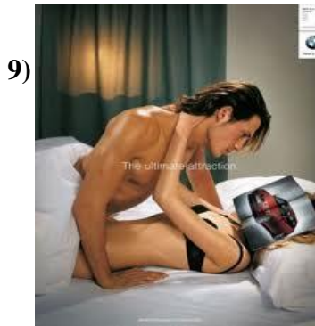
Figure 9: BMW. "An 'Easy' Ride," by News Activist, 2016 ( newsactivist.com/fr/node/11508 ). In the public domain.