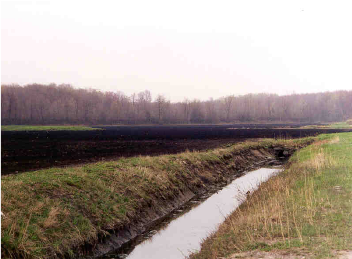
Figure 1. Ferlito Muck Fields

The muck fields adjacent to the constructed wetland represent two fields (C-1, 10.5 acres, and C-2 12.5 acres) (Fig. 1). Crops have been rotated between onions and sorghum during the two-year study period (Table1). Both fields were fertilized during the study period (Table 1) at