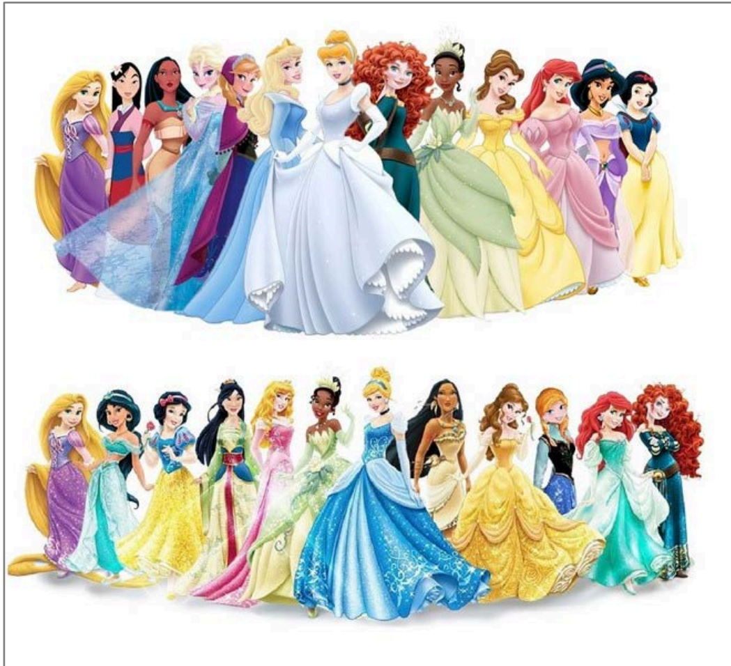
Figure 2. Disney Princess, before and after 2013 redesign (“Disney princesses,” 2015)

between the princesses before and after the redesign.