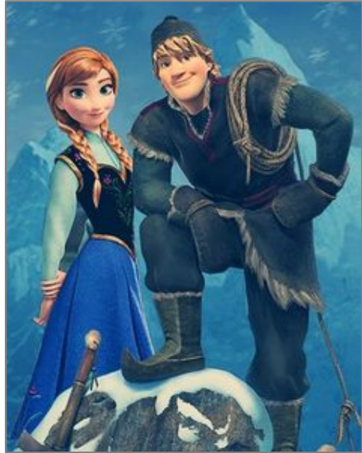
Figure 3. Anna and Kristoff (Disney, 2013)

be physical, because he has hands (and feet) that are proportionate enough to his body so that he can actually do activities. Granted, people do have all